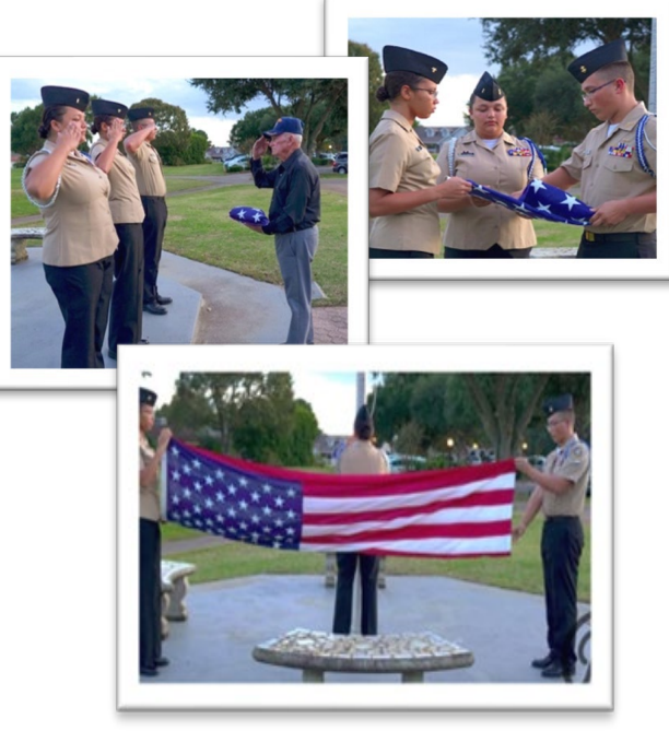
Dedicated to the Support of Veterans in the Florida Panhandle

The ceremony presents or retires a Flag -'colors' refer to the flag. Performed by a color guard, consisting of honor guards and flag bearers, the Sergeant-at-Arms, dictates orders during the ceremony. Proper respect should always be given to the colors during the ceremony. Then join us inside for conclusion of our ceremonies.